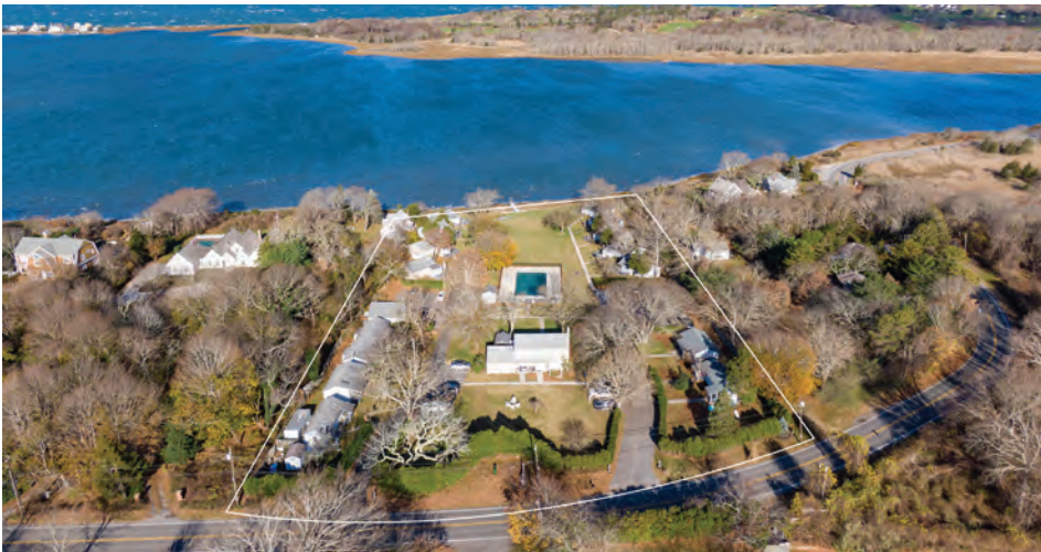
Shrubland Road, Southampton Southampton's Only Waterfront Resort Property