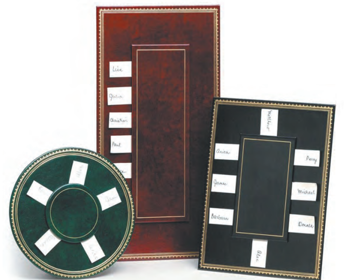
Scully & Scully Leather Table 9 x 16 Seating Arranger - $250