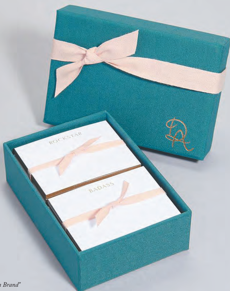
Dear Anabelle "On Brand" Place Cards - $60