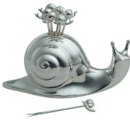
Ercuis Tuileries Silverplated Snail Cocktail Picks - $335