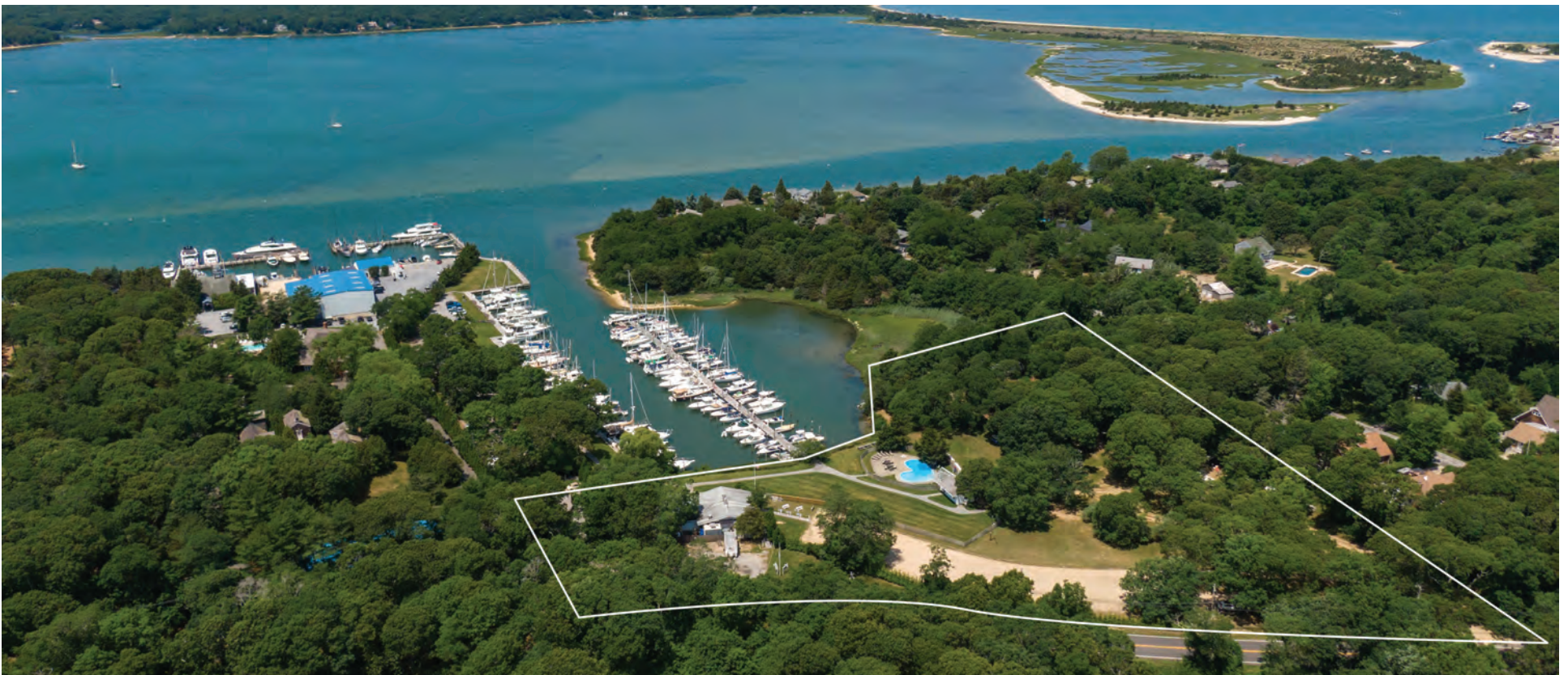
Three Mile Harbor Road, East Hampton Expansive Commercial/Restaurant Property

Servicing the East End of Long Island for all things commercial. 50 closed in transactions 2021.