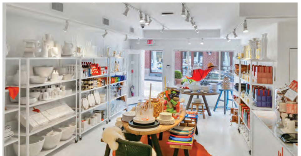
Washington Street, Sag Harbor Prime Retail Building with Apartment in Sag Harbor Village

For a confidential consultation regarding your property or small business please contact: