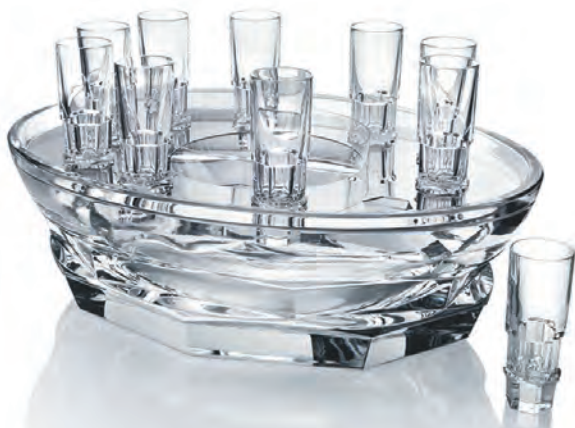
Baccarat Harcourt Abysee Caviar & Vodka Set - $7,500