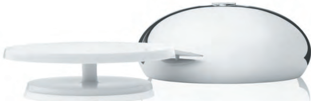
Puisforcat Argent Gourmand Cake Box - $3,200