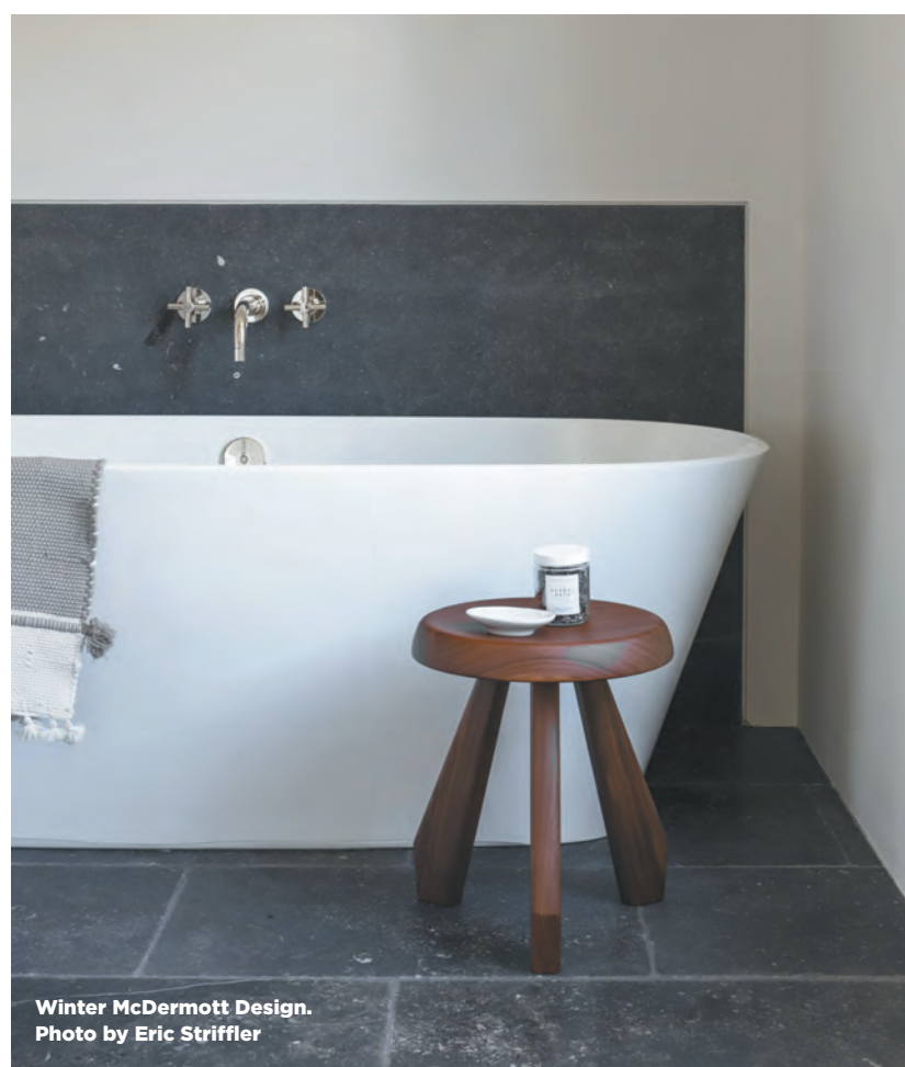
Winter McDermott Design.