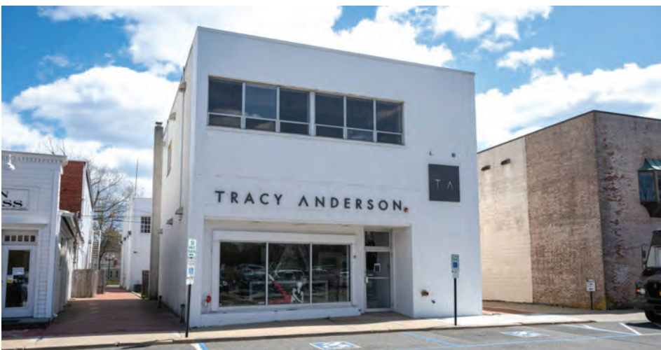
Park Place, East Hampton Expansive Retail Building in East Hampton Village