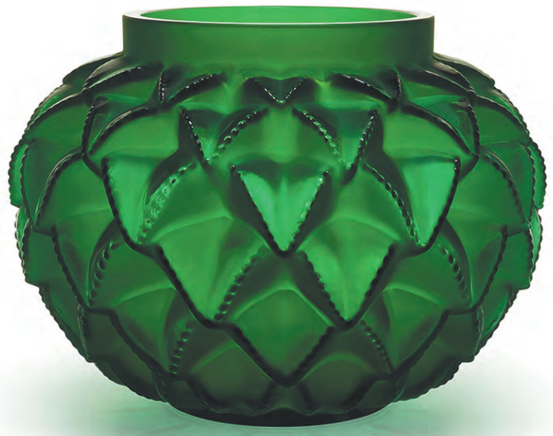
Lalique Languedoc Green Crystal Vase - $6,800