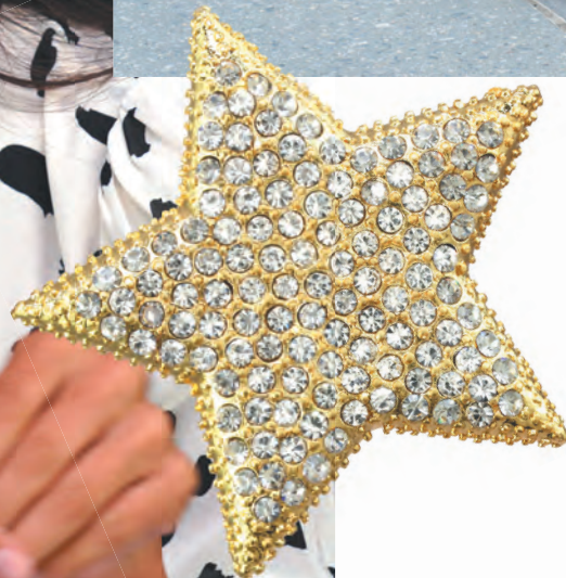
Stella + Ruby crystal star earrings - $46