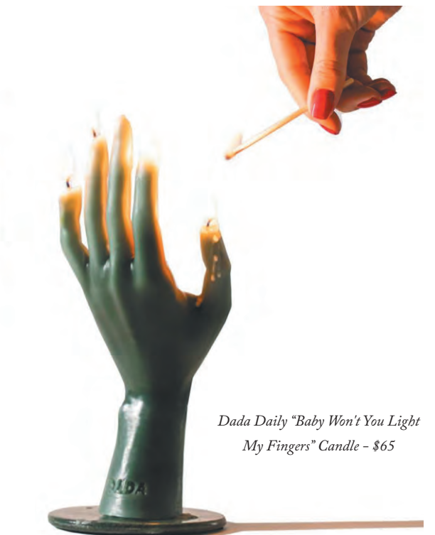
Dada Daily "Baby Won't You Light My Fingers" Candle - $65