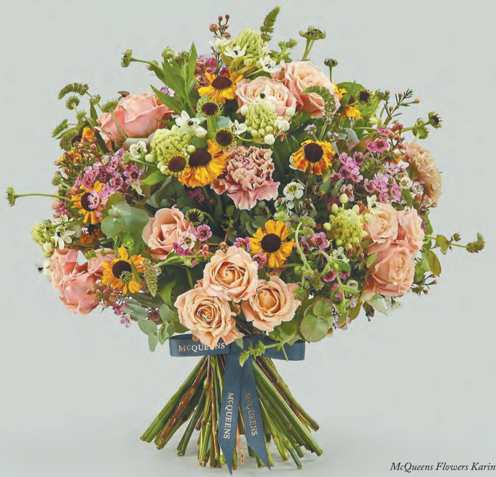
McQueens Flowers Karino Arrangement - $275