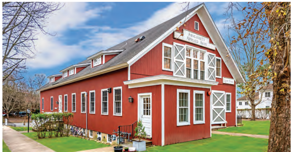
Indian Wells Highway, Amagansett Renovated Commercial Barn Variety of Uses