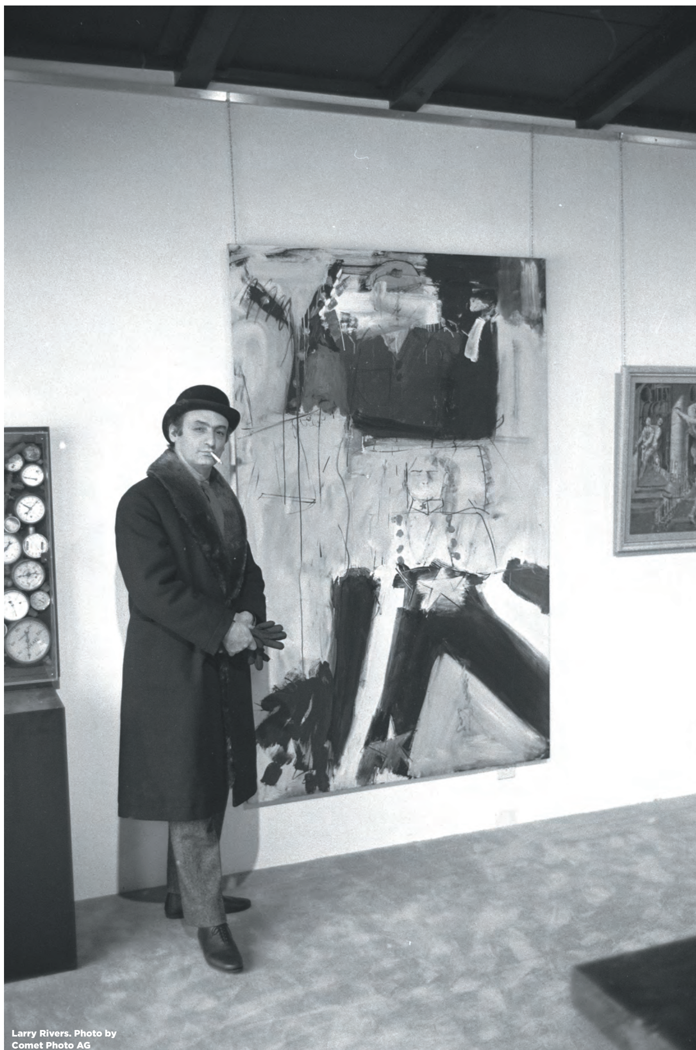
Larry Rivers.