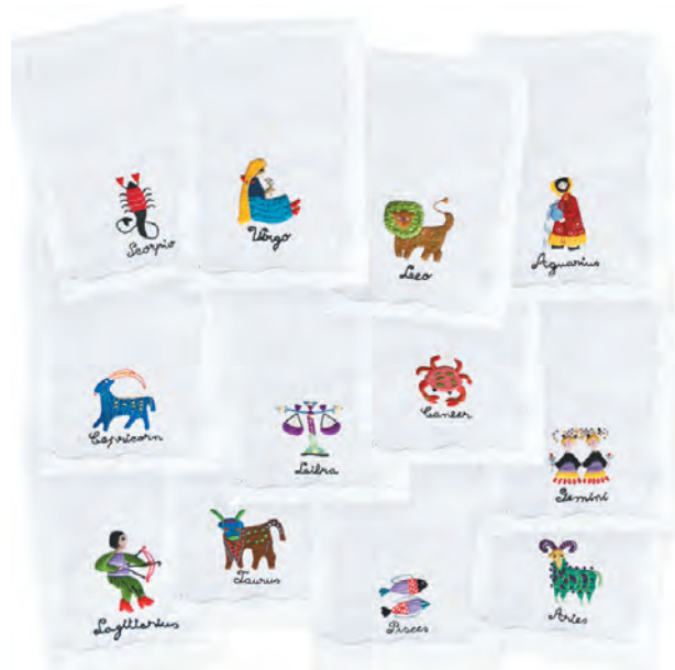
Biscuit Zodiac Cocktail Napkins - $175