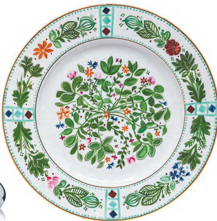
Cece Barfield Veranda Dinner Plate - $300