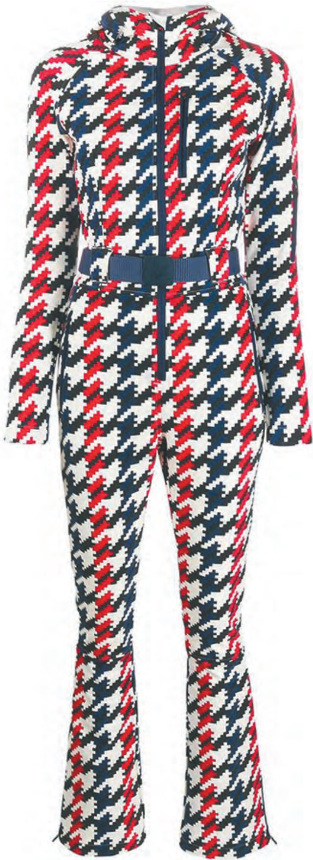
Perfect Moment Star Ski Suit Houndstooth Print. $990