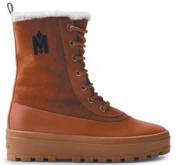
Mackage Shearling-Lined Lug-Sole Boots. $650