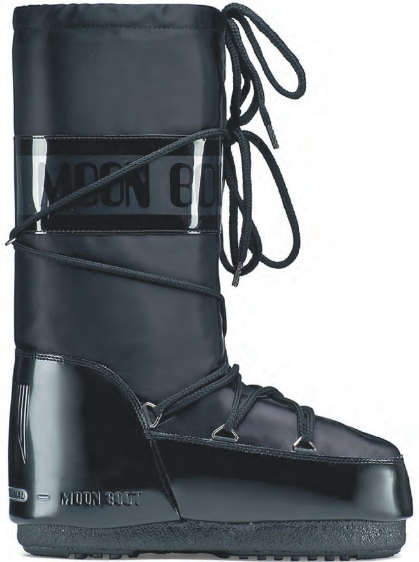
Moon Boot Icon Glance Boots. $215

Whether it be a chunky knit or a loud and proud ski suit, there is, indeed, an art to après ski dressing. Here, we've selected a few of our favorite items that will have you feeling fresh when you're fresh off the slopes, and turning heads at your champagne-swilling sunset soirée.