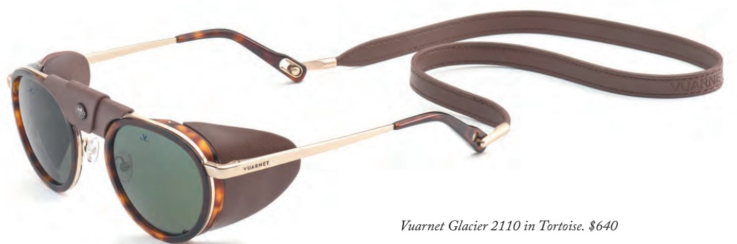
Vuarnet Glacier 2110 in Tortoise. $640