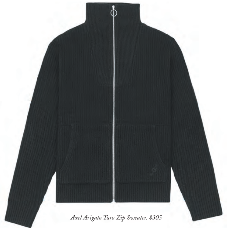
Axel Arigato Taro Zip Sweater. $305