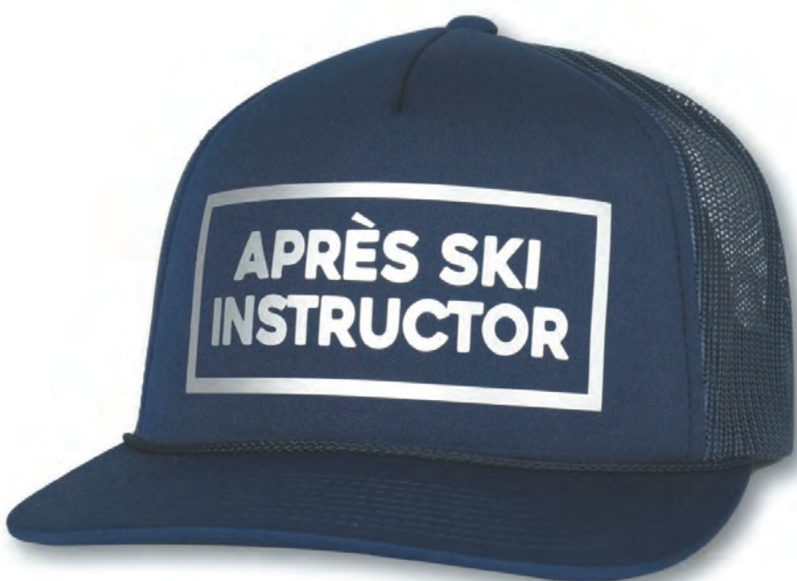
Ski Town All Stars Après Ski Instructor Hat. $36