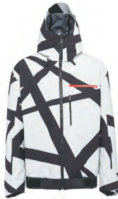
Men's ASPENX Prada Extreme Graphic. $5,100