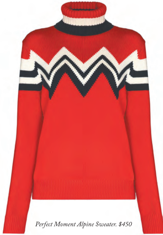
Perfect Moment Alpine Sweater. $450