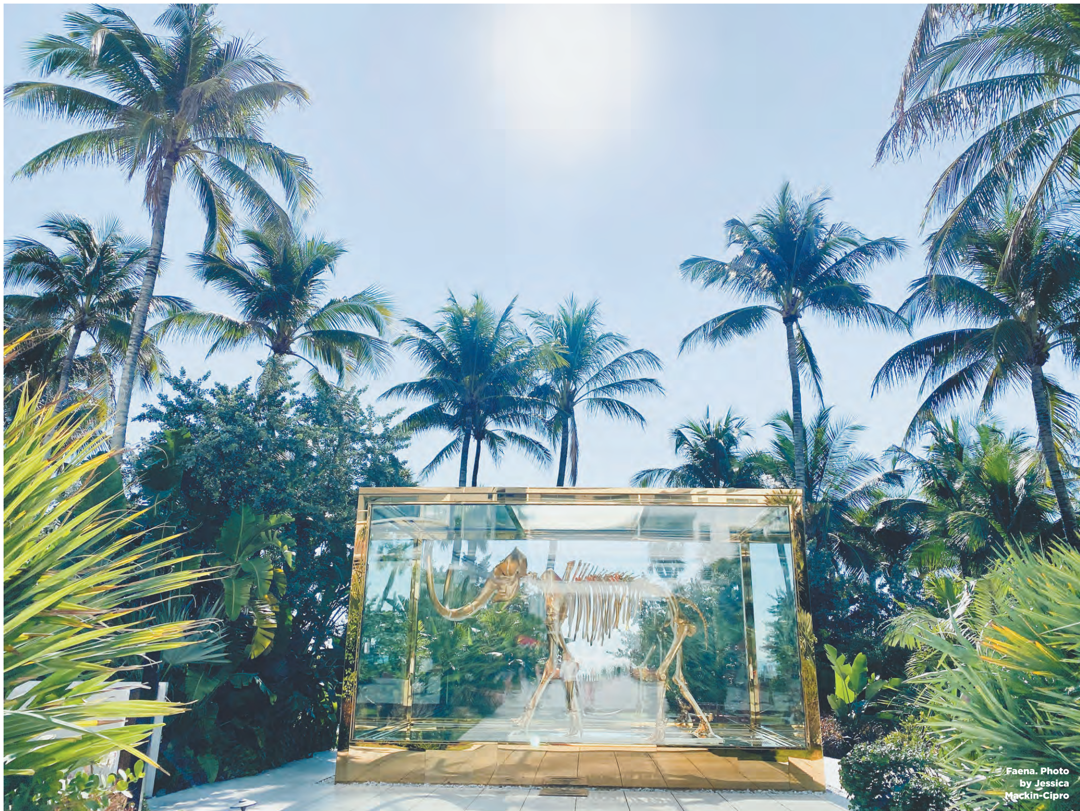
Faena.