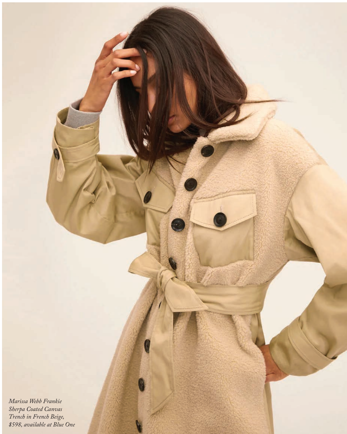
Marissa Webb Frankie Sherpa Coated Canvas Trench in French Beige, $598, available at Blue One