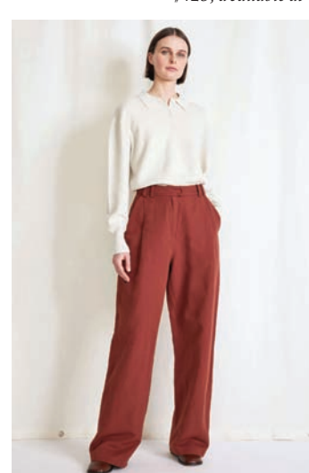
Apiece Apart Manon Trousers, $345; Apiece Apart Knit Polo, $425, available at Tenet

Website: joeywolffer.com Address: 11 Madison Street, Sag Harbor Instagram: @shopjoeywolffer