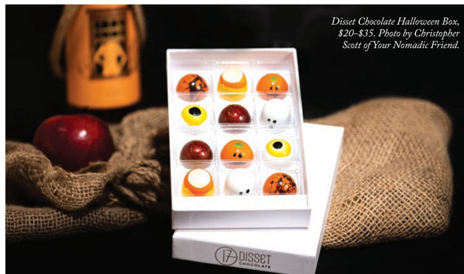
Disset Chocolate Halloween Box, $20-$35.