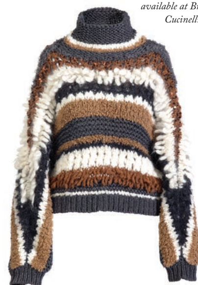
Handmade texture stripes sweater, price upon request, available at Brunello Cucinelli