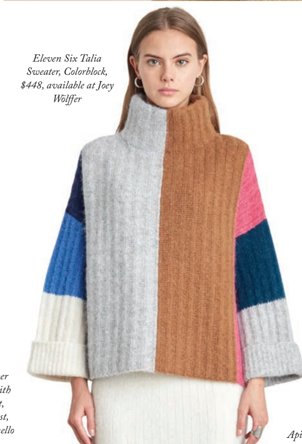
Eleven Six Talia Sweater, Colorblock, $448, available at Joey Wölffer

Website: brunellocucinelli.com Address: 39 Newtown Lane, East Hampton Instagram: @brunellocucinelli_brand