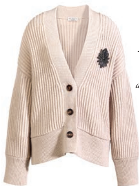
Cashmere Feather yarn cardigan with Swarovski crest, price upon request, available at Brunello Cucinelli

Heavy-Duty Boots: Grunge and punk will return in the form of "tough" boots. Combat, Motorcycle, and Chelsea Boots will be styled with pretty much anything—dresses, denim, and trousers.