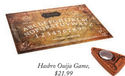
Hasbro Ouija Game, $21.99