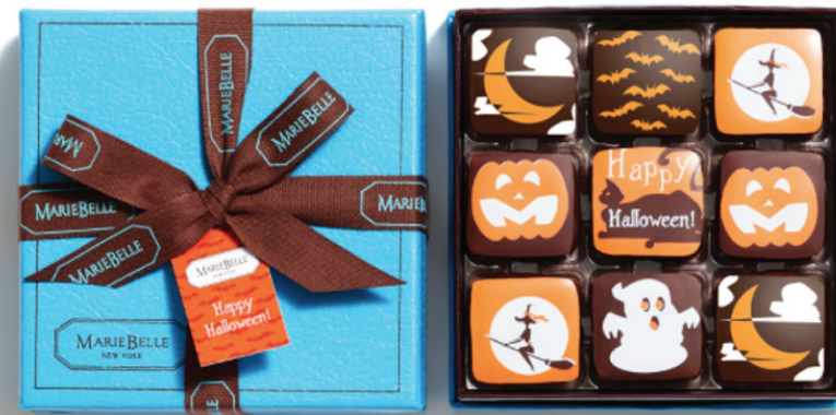
MarieBelle 9pc Halloween Chocolate Ganache Blue Box, $35