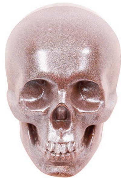
Shimmering Skull Cocoa Bomb, Dylan's Candy Bar, $12

MarieBelle in Soho. You can find an array of fun candy gifts at Dylan's Candy Bar in East Hampton, like this Shimmering Skull Cocoa Bomb or a Halloween Surprise Smash Pumpkin. If you're looking to bring the party games, try the Hasbro Ouija Board Game .