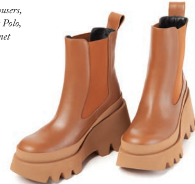
Paloma Barceló, Isak Boots in Iris Cuoió, $555, available at Blue One

Website: tenetshop.com Address: 91 Main Street, Southampton & 21 Newton Lane, East Hampton Instagram: @tenetshop