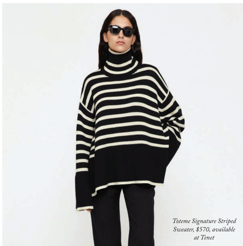
Toteme Signature Striped Sweater, $570, available at Tenet

Website: shopblueone.com Address: 2397 Montauk Highway, Bridgehampton Instagram: @shopblueone