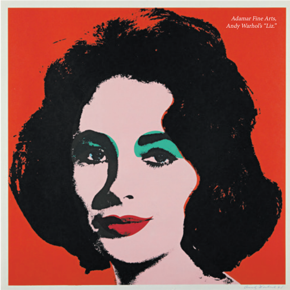
Adamar Fine Arts, Andy Warhol's "Liz."

The Hamptons Fine Art Fair Returns To Southampton For 19th Year