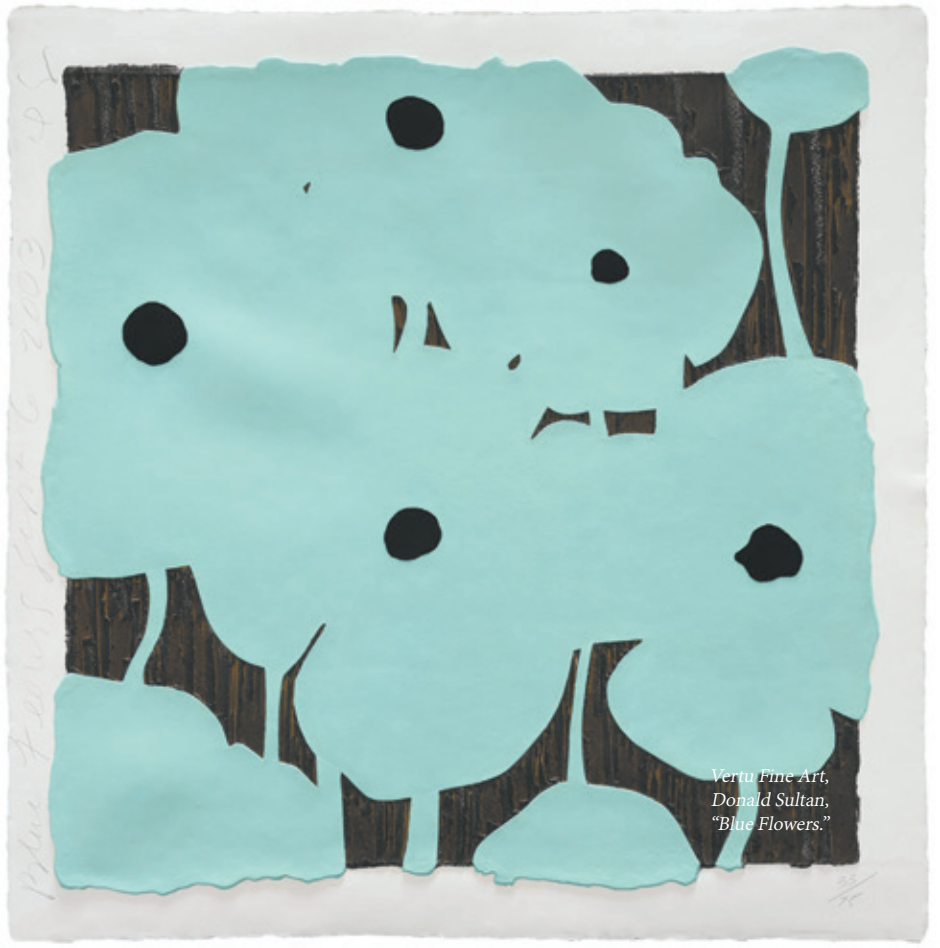
Vertu Fine Art, Donald Sultan, "Blue Flowers."

The fair’s Outdoor Sculpture Garden is where guests can enjoy delicious dining options, in-