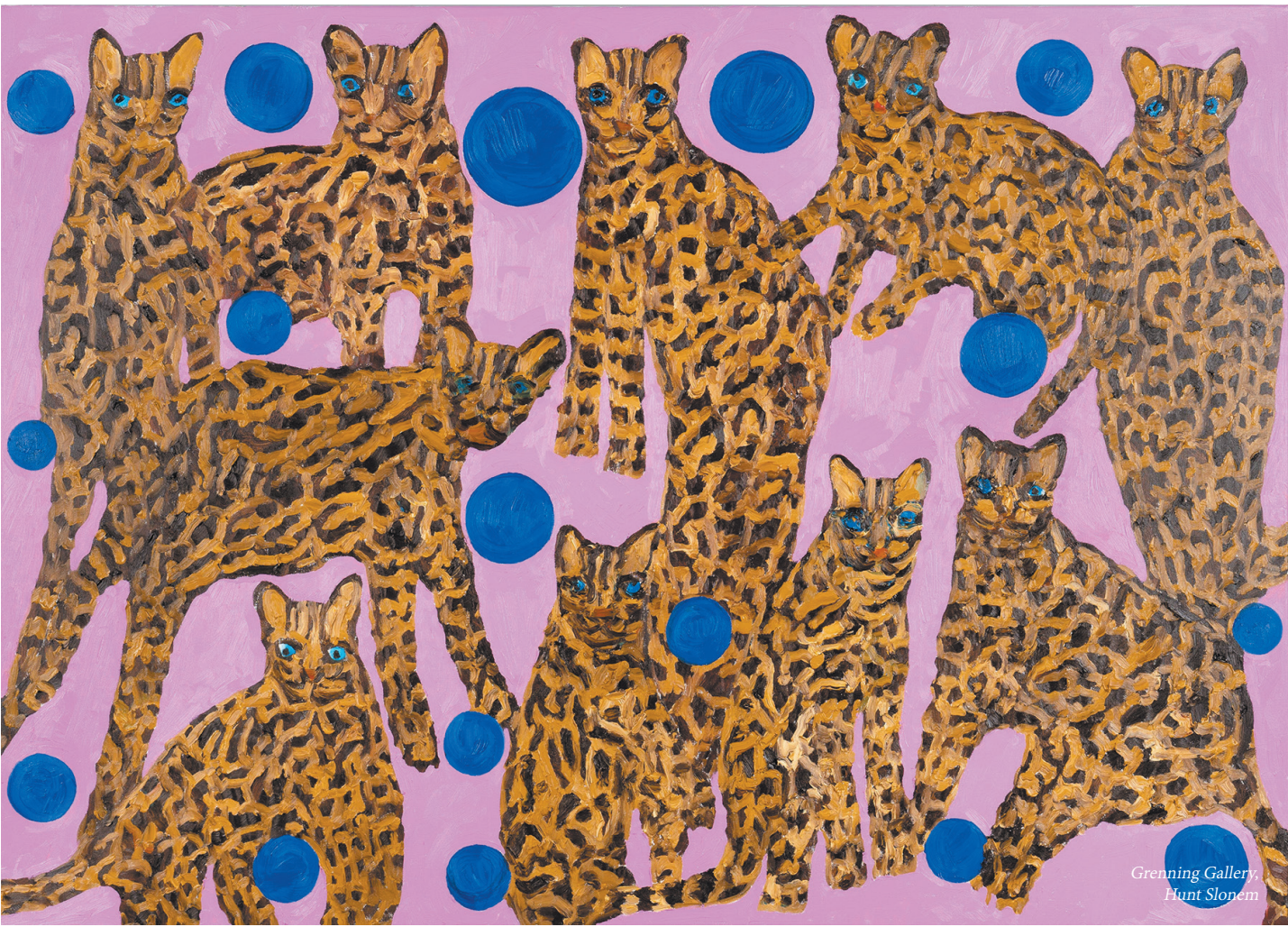
Grenning Gallery, Hunt Slonem

cluding a Shinnecock Lobster Roll and more, plus two large indoor bars will offer diverse wine and spirit selections with special tastings offered daily.