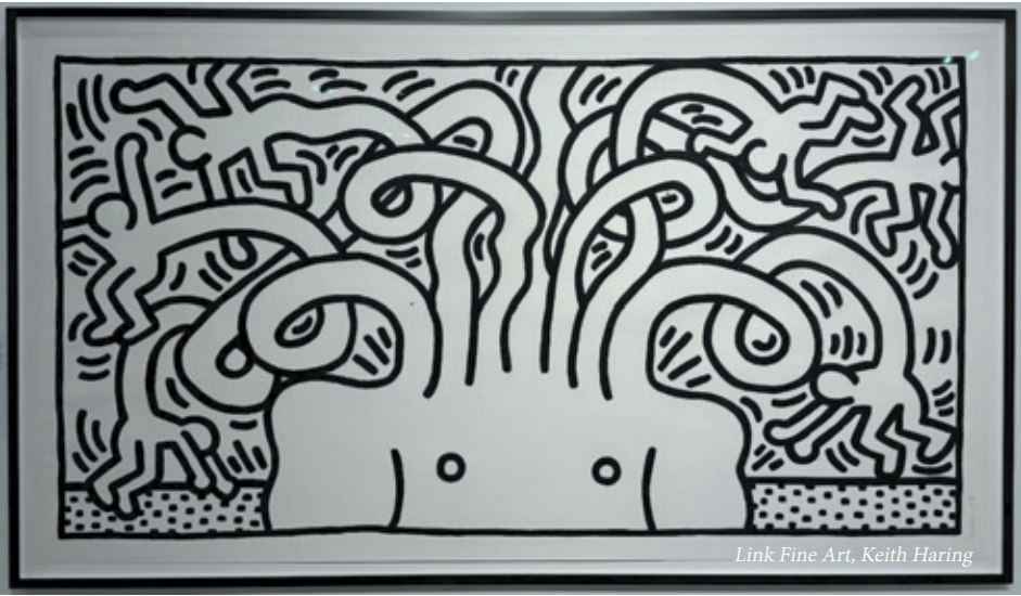
Link Fine Art, Keith Haring

The Real Surreal, presented by the Museum of Modern Renaissance, is an eye-opening Surrealist exhibit that is a small artistic subset of the actual Museum of