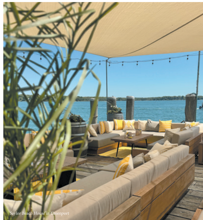
Saylor Beach House in Greenport

Hudson's Helping Hands for Autism will host its annual Wellness Day on Saturday, June 6, from 10 AM to 2 PM, at Hero Beach Club in Montauk.