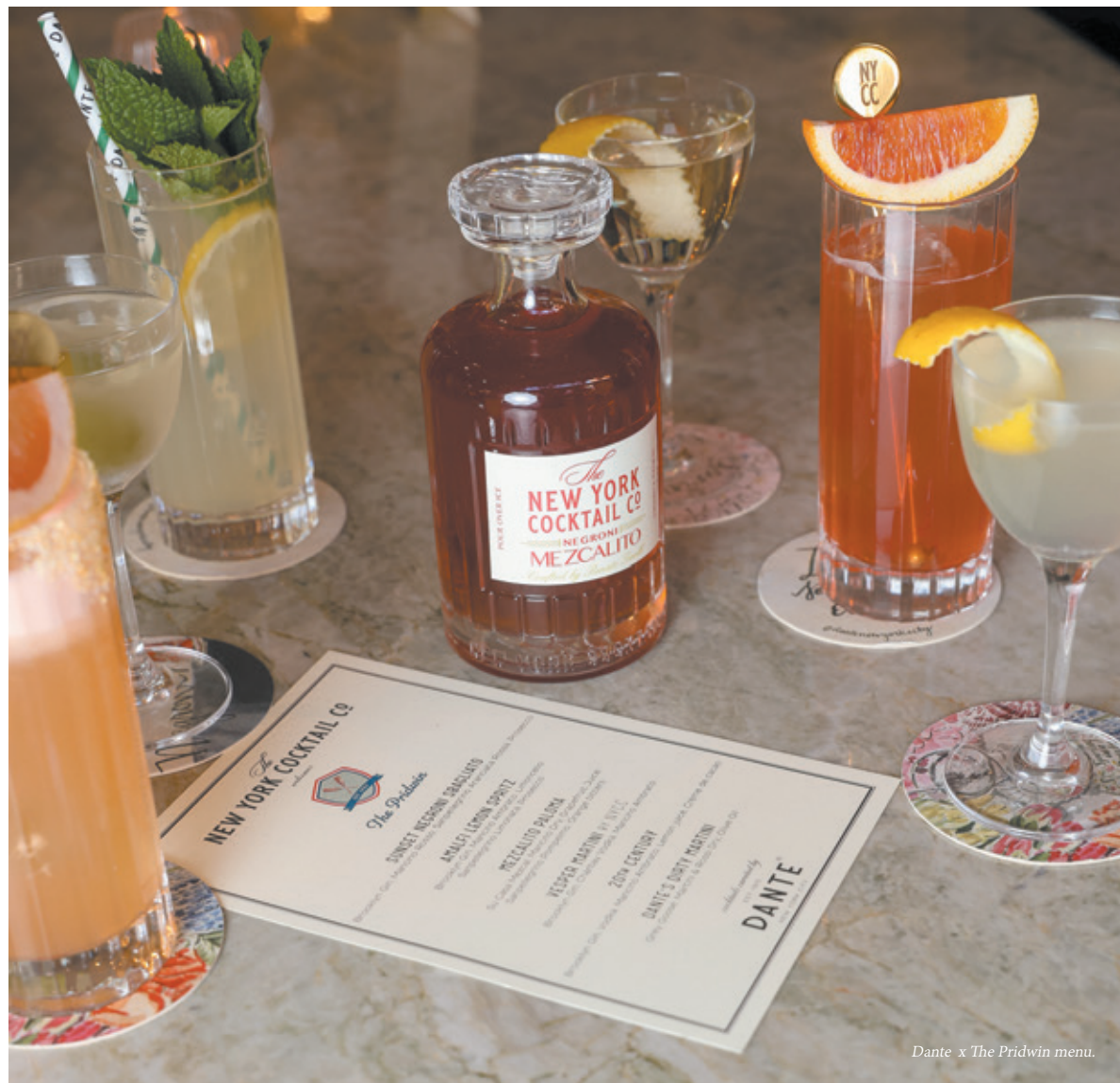
Dante x The Pridwin menu.