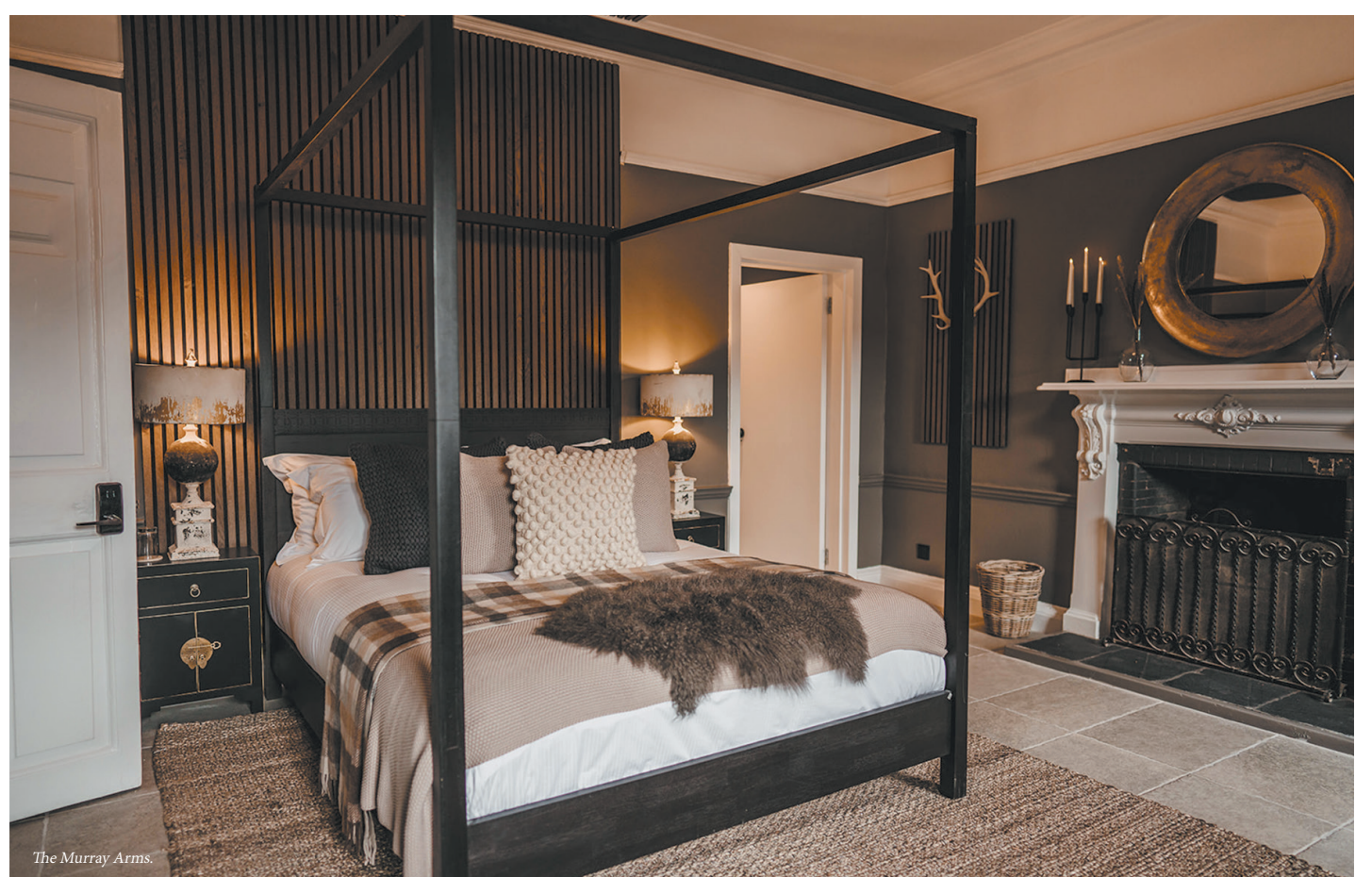
The Murray Arms