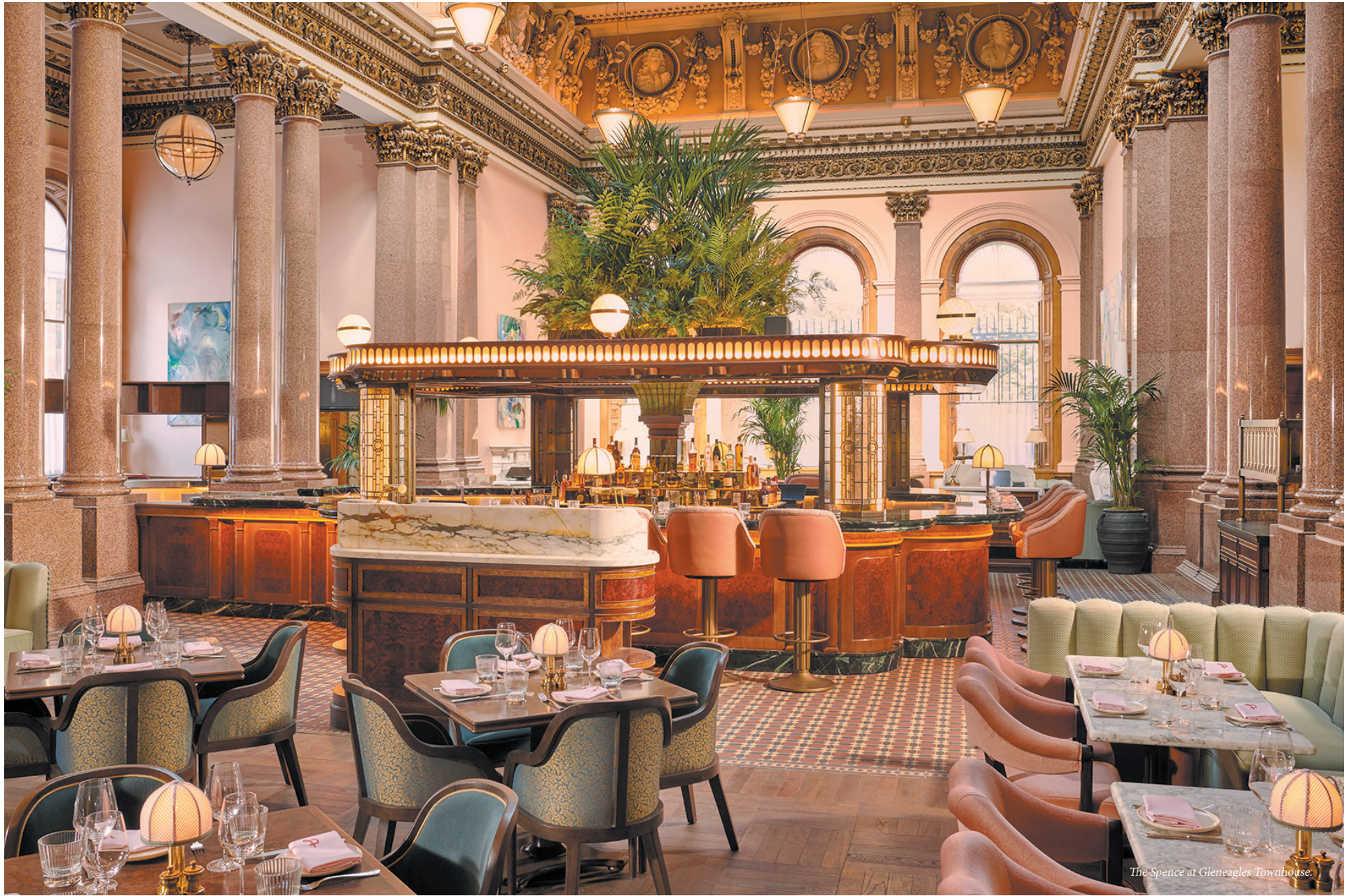
The Spence at Gleneagles Townhouse

Travel to Edinburgh to end the trip. Gleneagles, the esteemed sporting and country estate, offers Gleneagles Townhouse, a member of Leading Hotels of the World, in St Andrew Square, which is the perfect base for exploring the country's capital. The building, once home to the British Linen Company and later the Bank of Scotland, showcases exceptional architectural details throughout this charming sanctuary. Each room is uniquely crafted to reflect understated luxury and pay homage to the build-